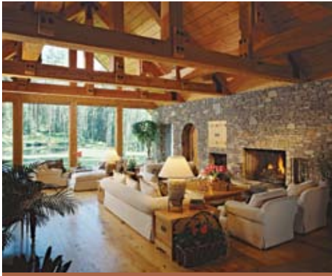
121 YELLOW BRICK ROAD

Brilliantly conceived and artfully executed ~ an ideal setting for a life well lived. Resting on over 4 acres, this site was the first estate picked from the original 800 lots in the Telluride Mountain Village by its master developer. Private, yet convenient ~ walk to the Mountain Village Center and ski in/out via your own exclusive ski trail. The graciousness of the home is complemented by a great room with wet bar, 4 bedrooms, 4.5 baths and gourmet country kitchen. Offered at $ 7,495,000