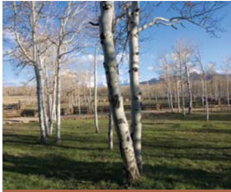
1230 LAUGHING DOG ROAD

Brilliantly conceived and artfully executed ~ an ideal setting for a life well lived. Resting on over 4 acres, this site was the first estate picked from the original 800 lots in the Telluride Mountain Village by its master developer. Private, yet convenient ~ walk to the Mountain Village Center and ski in/out via your own exclusive ski trail. The graciousness of the home is complemented by a great room with wet bar, 4 bedrooms, 4.5 baths and gourmet country kitchen. Offered at $ 7,495,000